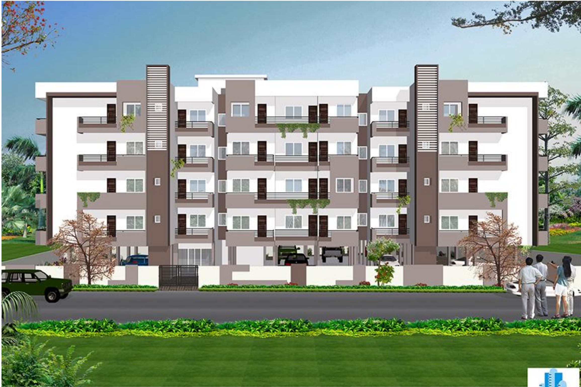
FRONT SIDE VIEW