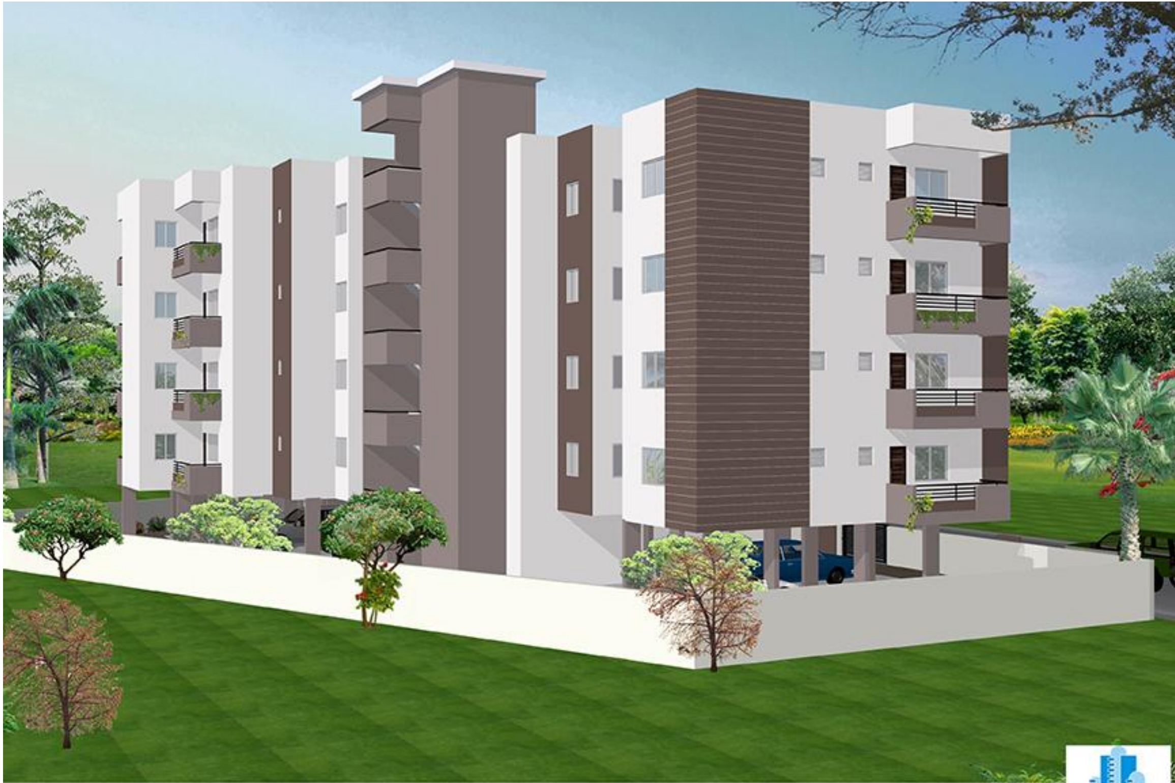
REAR SIDE VIEW