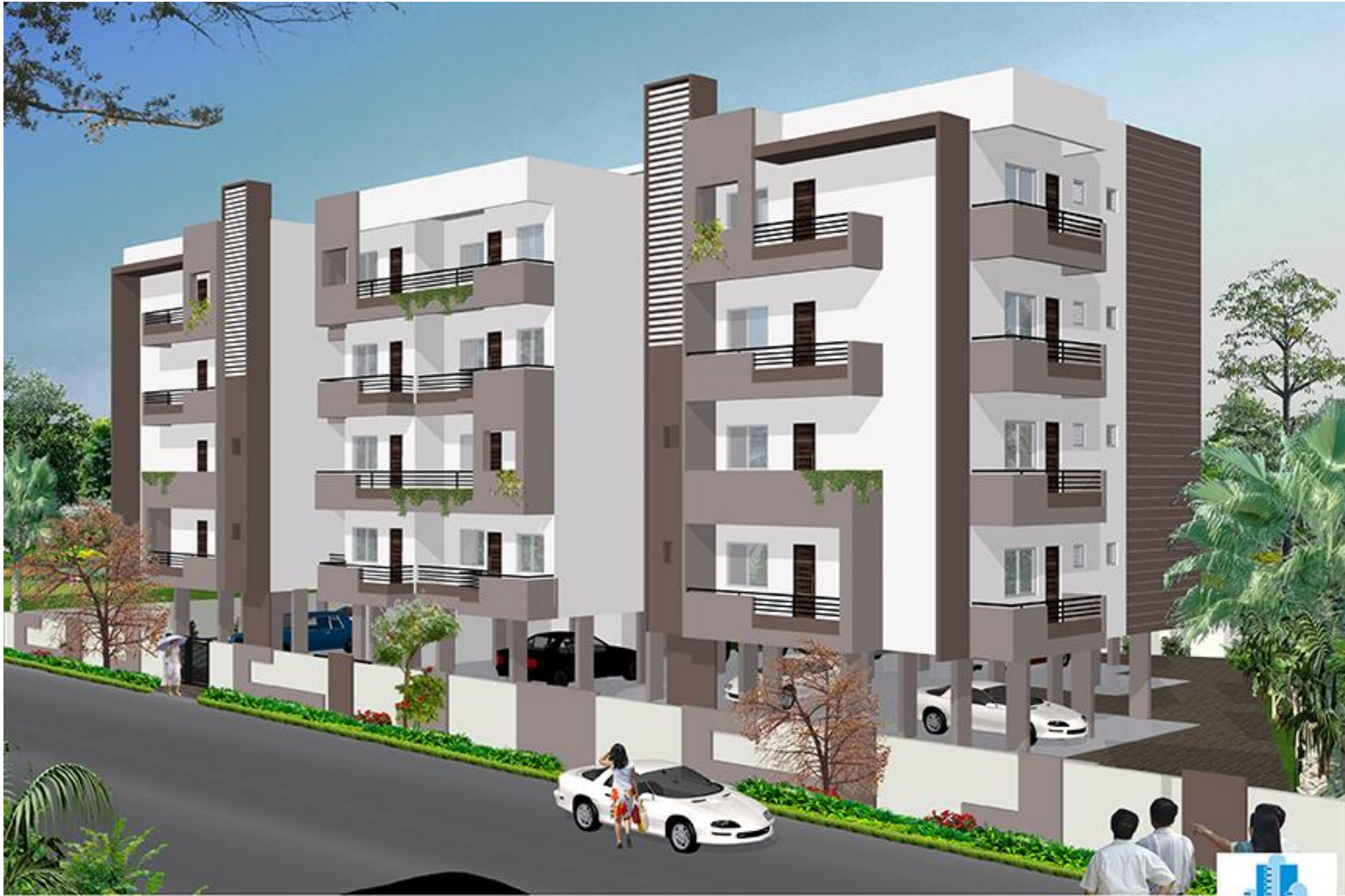
RIGHT SIDE CORNER VIEW